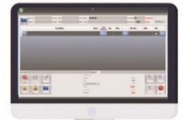
Point of Sales